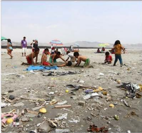
Camaná's Beaches - 2018 Local people enjoying a "Beach Day".