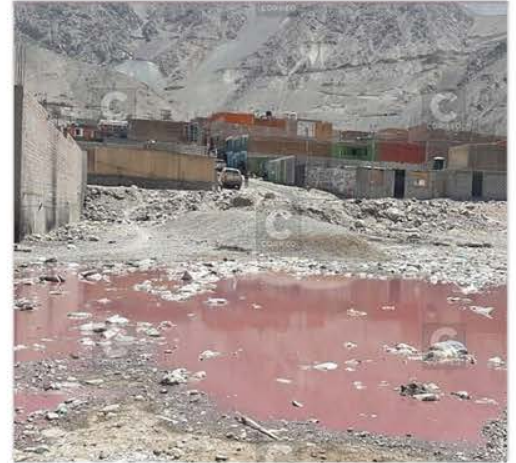
Effluents - 2020 Illegal mining in Urasqui.