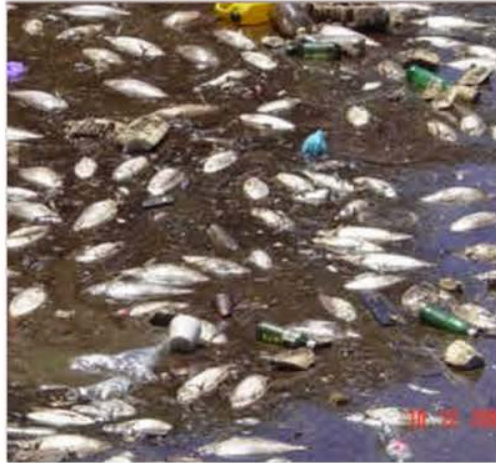
Dead fishes on CAMANÁ - 2019 Pollution effects.